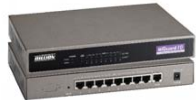
▲ BiGuard 10

BiGuard 10 is a rack-mountable device integrated with cutting-edge security technology including VPN and Firewall that enable you to connect your network to the Internet securely without worrying about intruders' attacks. This security gateway is perfectly designed for small offices requiring application-based network solutions with low-capital investment to communicate with headquarters and mobile workers. Robust VPN functions support office users to create remote access of multiple site-to-site encrypted private connections over the public Internet. The complete firewall features are built in to protect your network from intruders and Internet attacks. With the growing demand for Voice over IP and multimedia applications such as video broadcasting from SMB and SOHO users, the device features SIP pass-through and IGMP Snooping to facilitate the needs. The Quality of Service feature ensures a smooth net connection for inbound and outbound data with minimal traffic congestion. A rich-featured set in one compact unit makes BiGuard 10 the best and most affordable choice for small offices.